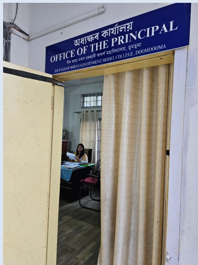
Office of the Principal